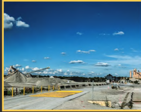
● Batch Plant