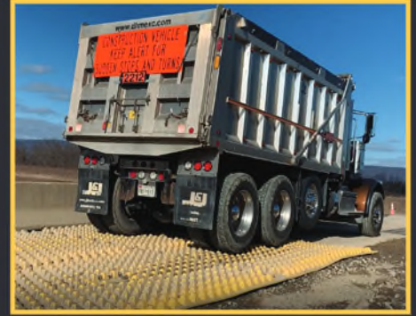
● Waste Transfer Station