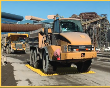
● Industrial Steel Plant