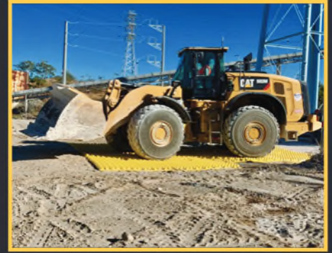
● Industrial Gypsum Plant